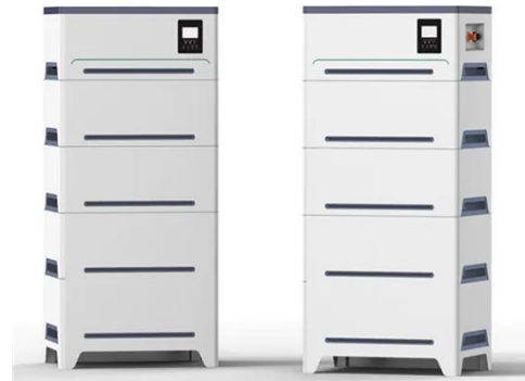
Images of inverter

Step 1: Diagnosis and Identification of The Problem Step 2: Replacing Faulty Components Step 3: Testing and Calibration The final step in repairing a pure sine wave inverter is testing and calibration. This ensures the inverter is functioning correctly and providing the necessary output. a. Initial Power-Up After replacing the faulty components, power up the pure sine wave inverter and observe its operation. Check for any abnormal behavior, such as excessive heat, n See more on inverter Images of Jerusalem Repair Pure Sine Wave Inverter Pure Sine Wave Inverter 1Kv Pure Sinewave Inverter Pure Sine Wave Inverter Wave Inverter 48 Volt Inverter Pure Sine Wave Pure Sine Wave Inverter 48V Inverter Pure Sine Wave 24V Pure Sine Wave Inverter 24 Volt Inverter Pure Sine Wave Modified Sine Wave Power Inverter 3 Steps to Repair Pure Sine Wave Inverter , inverter 3 Steps to Repair Pure Sine Wave Inverter , inverter 3000W Pure Sine Wave Inverter Repair Tips ????? - How to Fix Pure Sine Wave Inverter? , ATO GEHPYYDS 6000W Pure